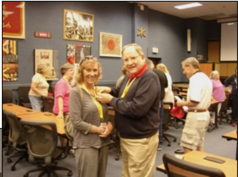
A “Little” bit of recognition following the Womens’ program at the 2018 reunion

So pack up your gear, including an umbrella, and plan to join the gathering in Cleveland next Spring. Let’s get our next 100 years off to a good start!