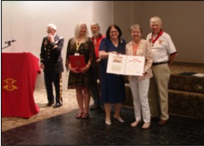
Receiving the Molly Pitcher Award