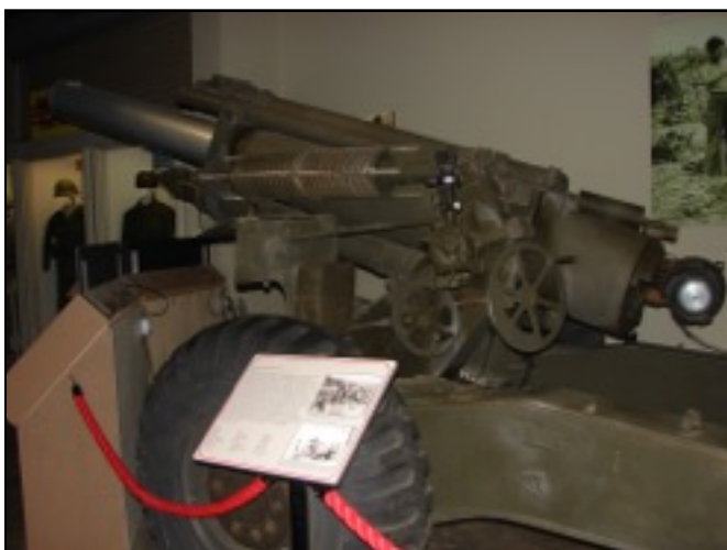
Our “weapon of choice” in the Ft Sill Museum