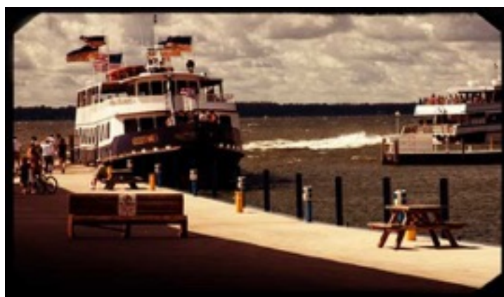
The GOODTIME I docked at Kelly's Island