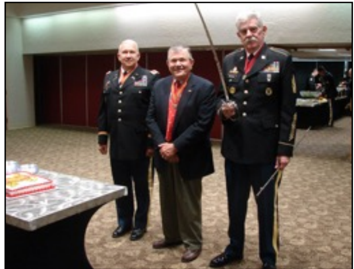
“Overkill” at the Cake Cutting after the Banquet