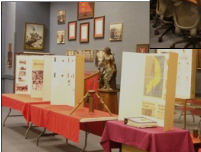
Setting up for the Memorial Service in Snow Hall