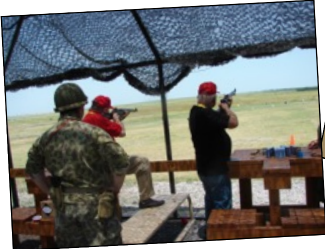
READY, FIRE, AIM!