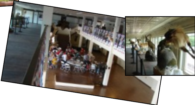
Lunch in Hobart in a hall full of stuffed animals!