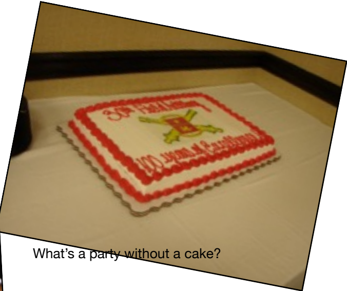
What's a party without a cake?