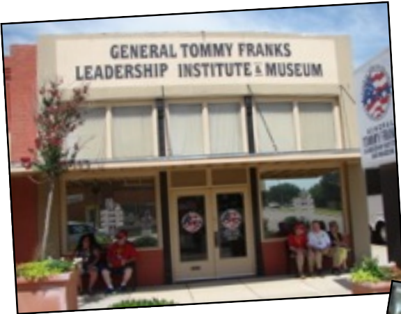
A modest entrance to a fascinating collection