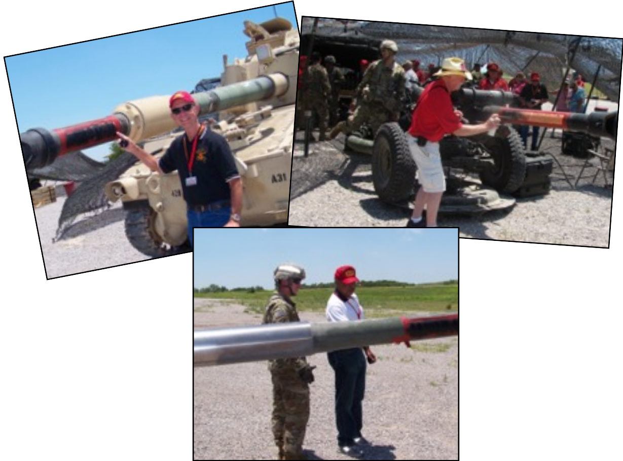
Naming the guns before the live fire demonstration