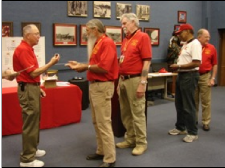
Members receiving the Vietnam Commemoration Pins at the Reunion