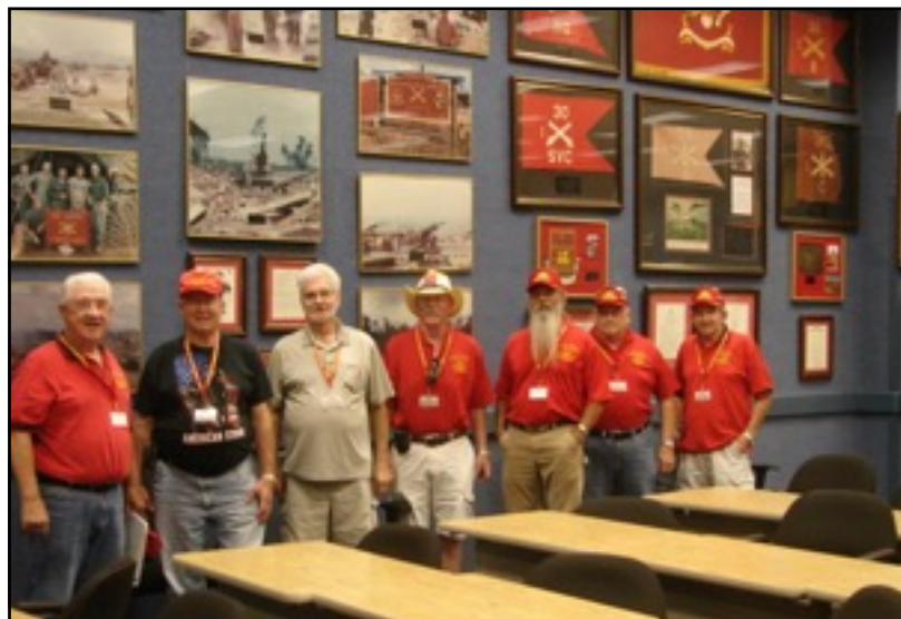
Reunion attendees in the Regimental Room at Snow Hall (above) and watching the activity on the guns