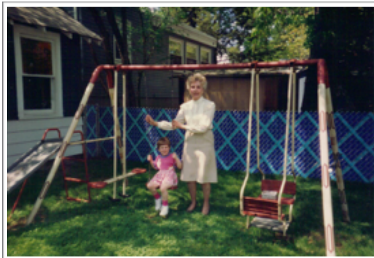
A Hedstrom Union Swing set, circa 1950/60